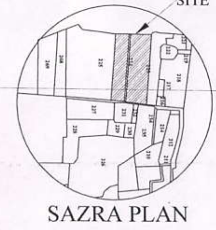
SITE LAYOUT PLAN SCALE 1:200

SOUTH CITY LAYOUT MAP ALREADY SANCTIONED